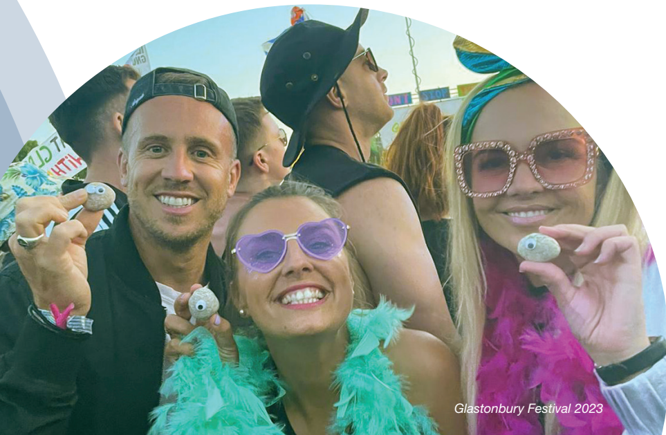
Glastonbury Festival 2023

Our Earth Science Ambassadors project, kindly supported by Bluewater for a second year, trains university geoscience students to mentor school pupils, igniting interest in geoscience careers. The programme continued to go from strength to strength in 2023, with multiple training sessions throughout the year leading to an additional 25 fully trained ambassadors delivering 12 workshops to almost 400 children in and around London. During Earth Science Week in October, we hosted a range of exciting activities, including our WallE screening for children, accompanied by a family fun day supported by the UK Space Agency and AstrobiologyOU, and our 30th anniversary screening of Jurassic Park. The movie screenings combined with exhibitions and talks throughout the whole week drew hundreds of people to Burlington House.