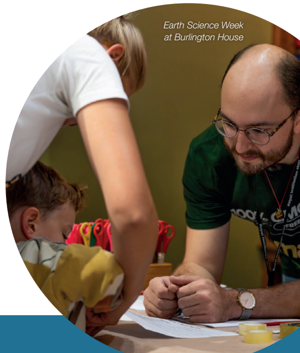
Earth Science Week at Burlington House