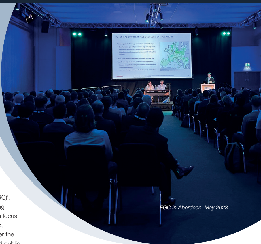
EGC in Aberdeen, May 2023

Our new conference series, GeoFutures, launched in 2023 to focus on geological solutions to the 21st century global challenges we all face. Digital Geoscience: Unleashing the power of data and technology in