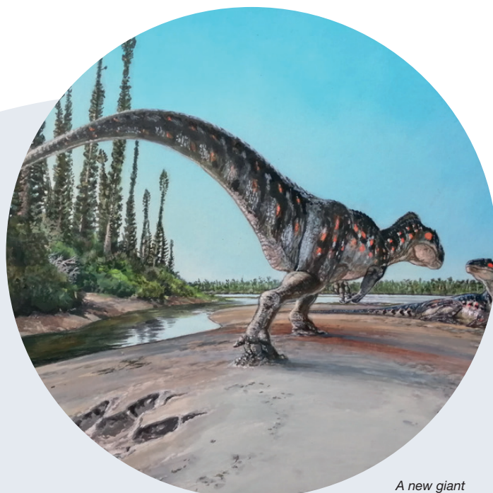
A new giant theropod dinosaur track from the Middle Jurassic of the Cleveland Basin, Yorkshire, UK Illustration © James McKay