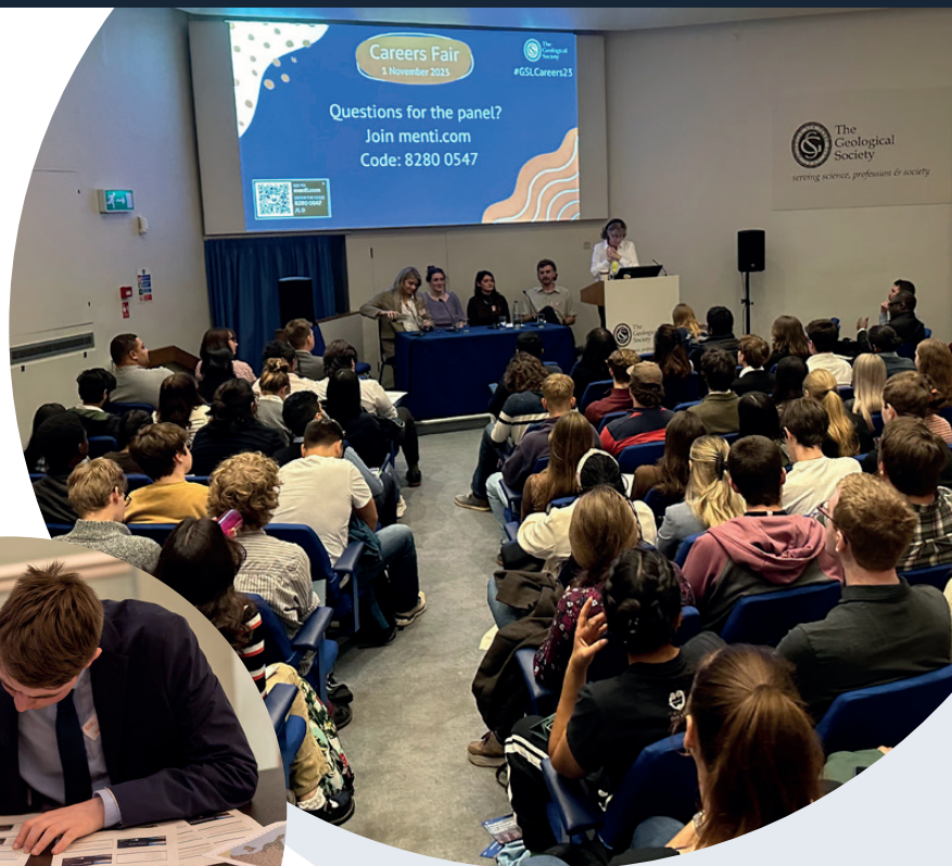
Careers Fair 2023

In 2023, we were invited to showcase the relevance and significance of geoscience at various popular family festivals including Glastonbury, Oxford STEMfest, Let's Talk Science Dublin, the Royal Institution's Family Fun Days, and Green Man in Wales. As a repeat guest at Glastonbury's Science Futures field, we shared a new initiative, 'We Will Rock You!', with hundreds of young people joining us in uncovering the secrets of Earth's minerals and materials used in glitter, makeup, and body art. Through these collaborations, we reached thousands of families, demonstrating the vital role of geoscience in our everyday lives.